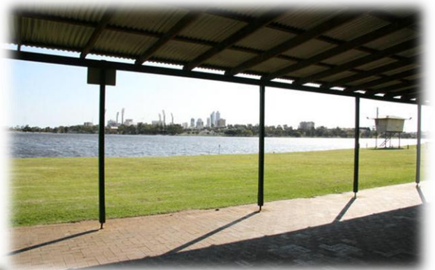
View of course from Club Veranda