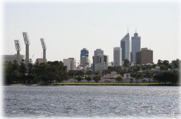
View from Club Rooms